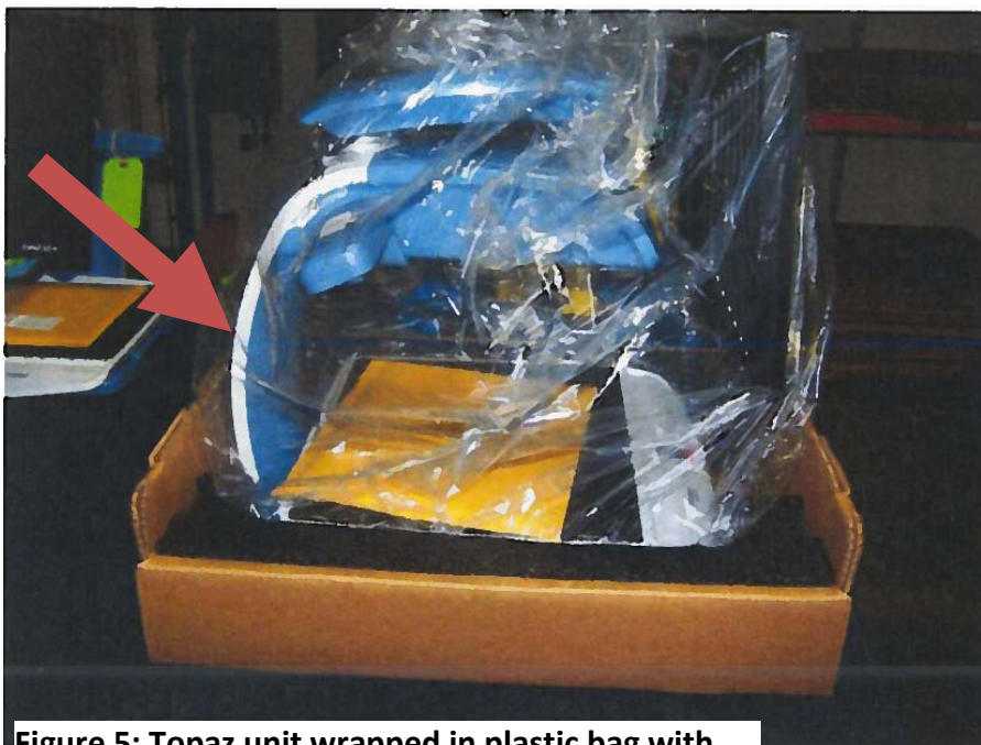
Figure 5: Topaz unit wrapped in plastic bag with documentation on the reading tray.