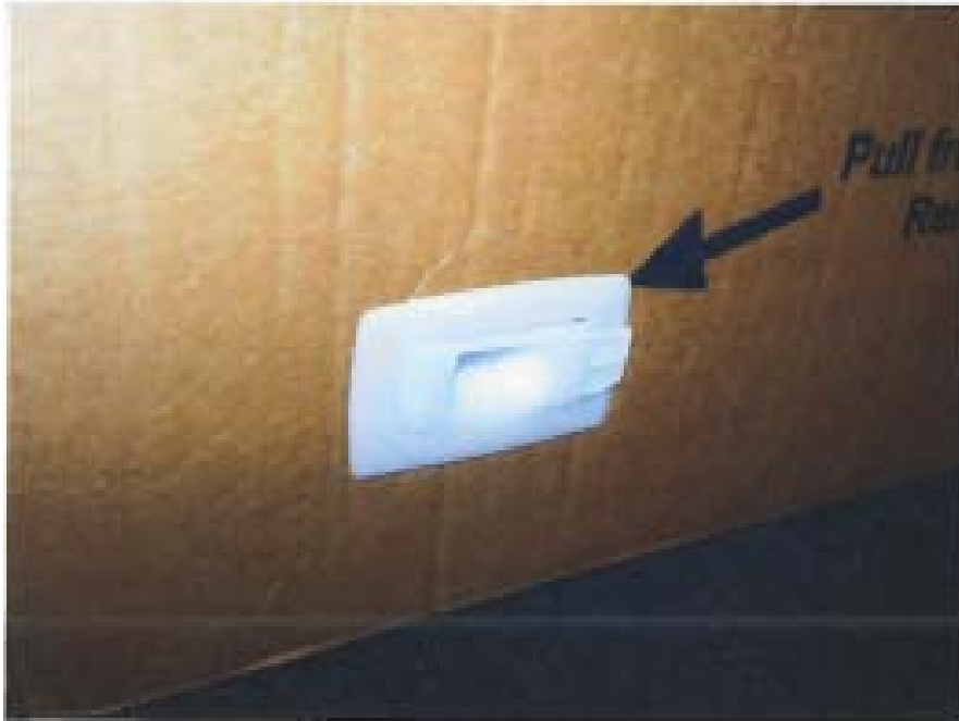
Figure 1: White clips in a closed position.