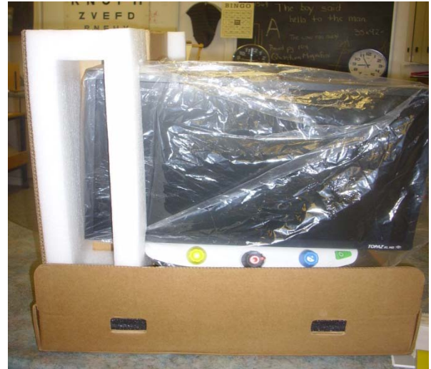
Figure 4b: Right support removed with only the left support remaining.