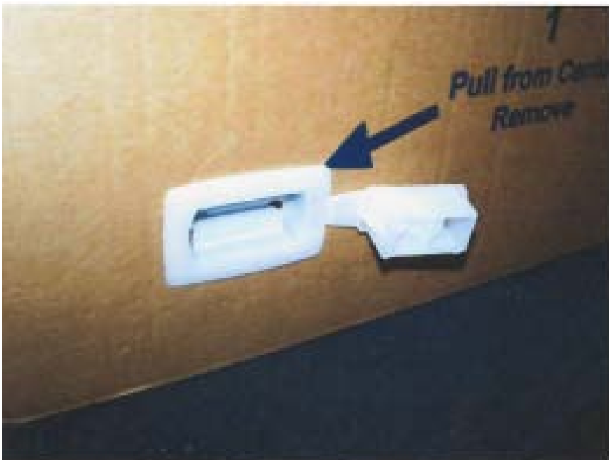
Figure 2a: White clip after it has been snapped open.