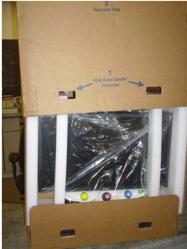
Figure 3: Box top being lifted off of box tray.