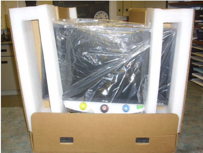
Figure 4a: Left and right support cradling the monitor